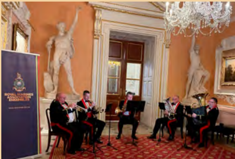
The Royal Marines Association Brass Quintet providing musical entertainment