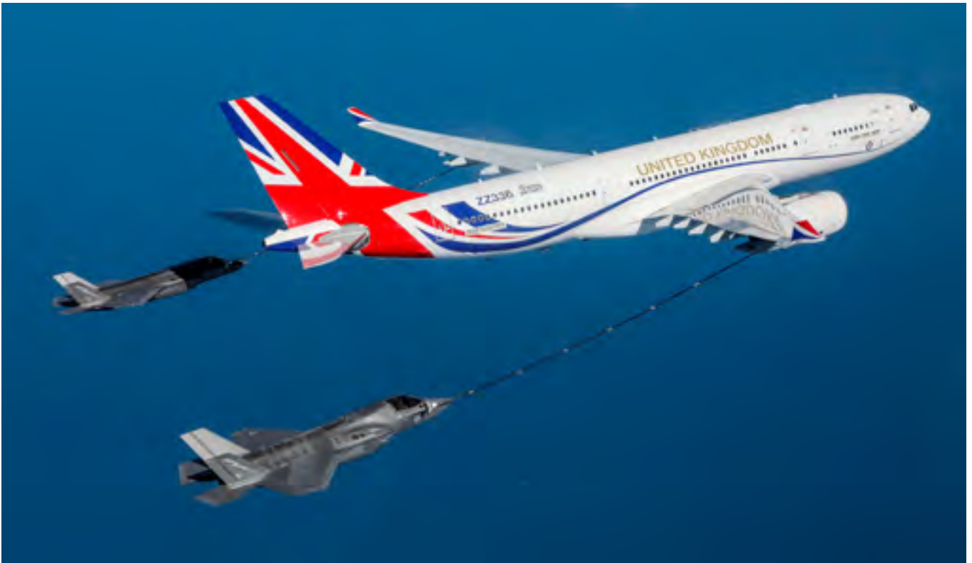
Inflight refuelling of two F35 Lightnings by RAF Voyager

The issues facing the military are in many ways similar to those of the commercial world – just more so! Most of the fuels themselves are intrinsically no different from those used elsewhere, whether it be jet fuel or diesel, gas or nuclear power, but the focus on guaranteed security in what appears to be an increasingly unstable and volatile global environment must also be recognised. The demands put upon the military are increasingly diverse but in some cases novel or unique.