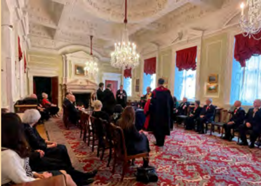
Fuellers Ceremonial Court, April 2024

The proceedings commenced with guests being presented by the Beadle to the receiving line of the Officers and Consorts, followed by a convivial pre-dinner drinks reception which enabled Fuellers and Carmen to mingle and connect in the chandelier-adorned Salon, before moving through to the Egyptian Room for dinner and formal proceedings.