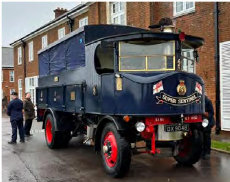
HMS Sultan Annual Affiliates Day

We are long term supporters of HMS Sultan and I could not help remembering, as I drove home to Buckinghamshire, my first visit with four of our children, then all under nine: our fifth and youngest, now 26, had only just been born. We were royally entertained – on both occasions. The site of that first visit is, however, now a housing estate!