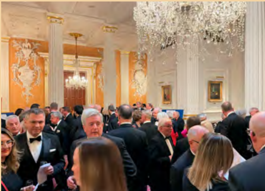
Drinks reception prior to Woodmongers' Banquet in the spectacular surroundings of the Salon at Mansion House