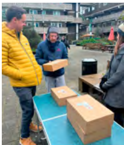
CEL Winter Warmer boxes

In December the Trust gave CEL (Community Energy London) a grant so they could distribute Winter Warmer boxes to households in the Middlesex Street Estates in the middle of January. Filled with LED lightbulbs, leaflets containing tips and instructions on energy efficiency – just as important – the boxes enable the start of a conversation on what can be a delicate subject for people struggling to meet their bills.