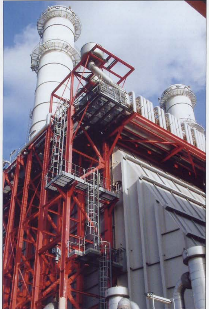
The exterior of the waste heat boilers at the Sutton Bridge 800 MW combined heat and power generating facility.