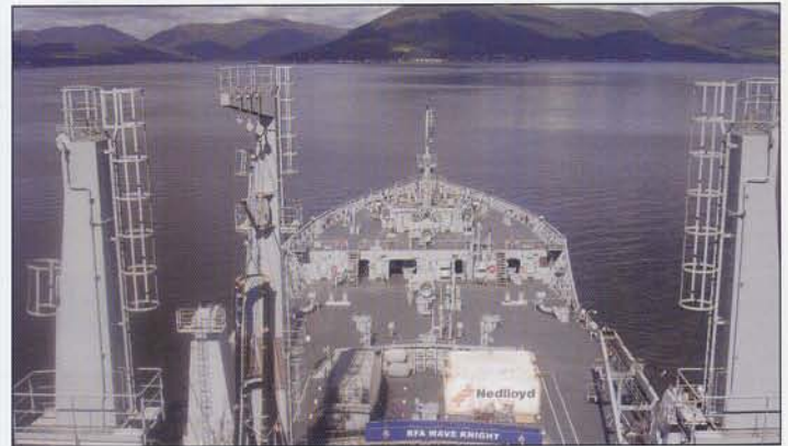
View from the bridge as RAF Wave Knight enters the Clyde.