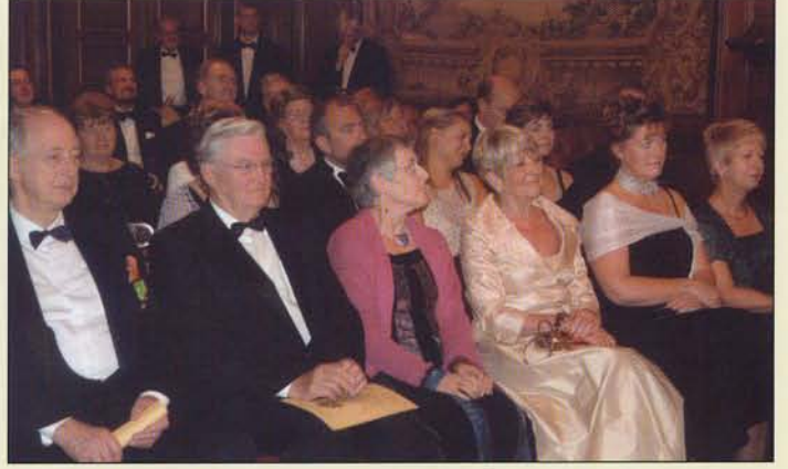
The Installation Ceremony was exceptionally well attended.