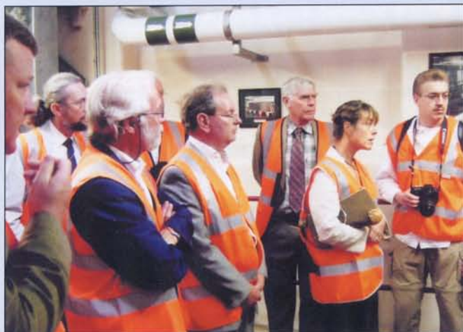
The intricacies of the brewer's art were explained in detail to the Fuellers' party.