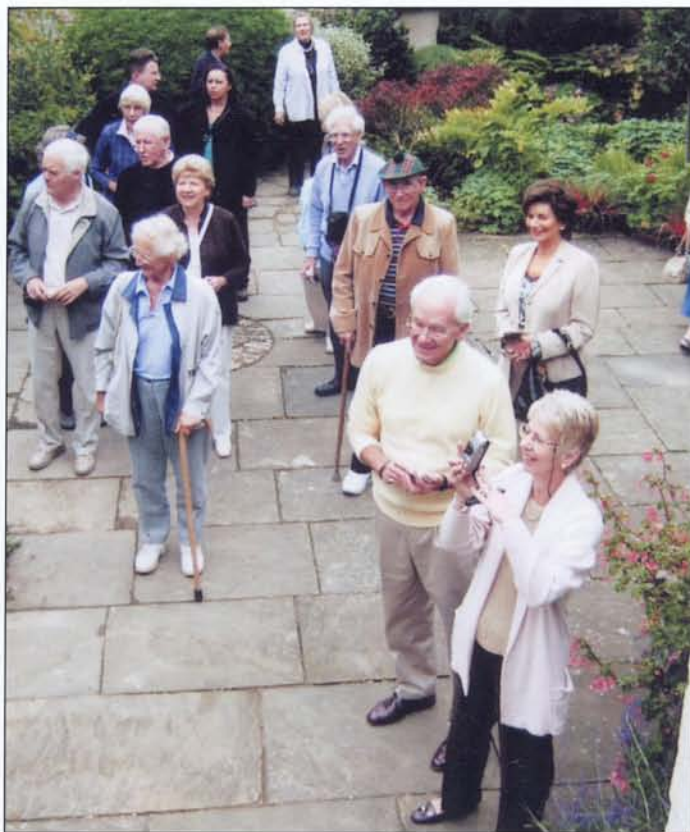
The party of Fuellers enjoy the unexpected charms of the Peto garden at Iford Manor.

On the following morning, the party drove a short distance to the American Museum in Britain, housed in Claverton Manor. The Master had arranged a private guided tour of the museum, prior to the normal public opening hours. The building houses the finest collection of American decorative art outside the United States. The main collection is arranged as a series of furnished rooms dating from the 17th to the mid 19th century. There is also an outstanding collection of quilts, 40 of which were on display. After lunch, several of the party stayed on for a Big Band Concert in the grounds, an event which was marred to some extent by poor weather. The rest departed for another visit to Bath, or for the return journey home. All agreed that it had been a most enjoyable social occasion.