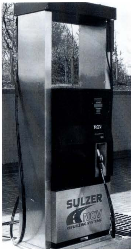
Sulzer Natural Gas Pump serving Transco district fleet of NGV's in Kent.

With a pilot project underway in Kent aimed at setting up refuelling stations for its district fleet of 50 NGV's they are looking at other sites, including those owned by fleet operators, to encourage them to convert to natural gas.