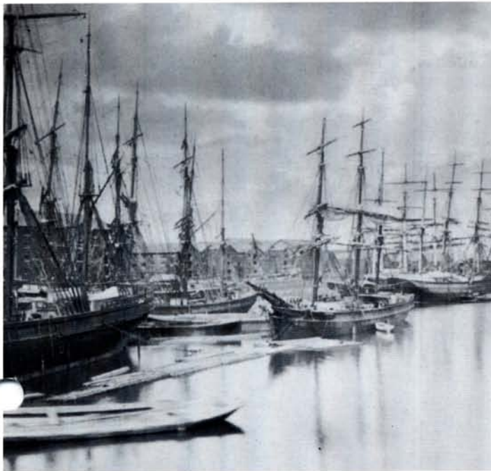
General View of Canada Dock in 1878

Led by Blue Badge Guide Judy Pulley 44 members and guests undertook a very informative and enjoyable tour of London Docklands in July. The 8 square miles of docks were once the busiest port in the world handling cargoes from the four corners of the globe.